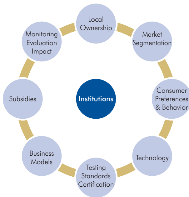
Figure 1: Main Areas of Project Design Principles

Figure 1 shows the main areas from which project design principles are drawn.