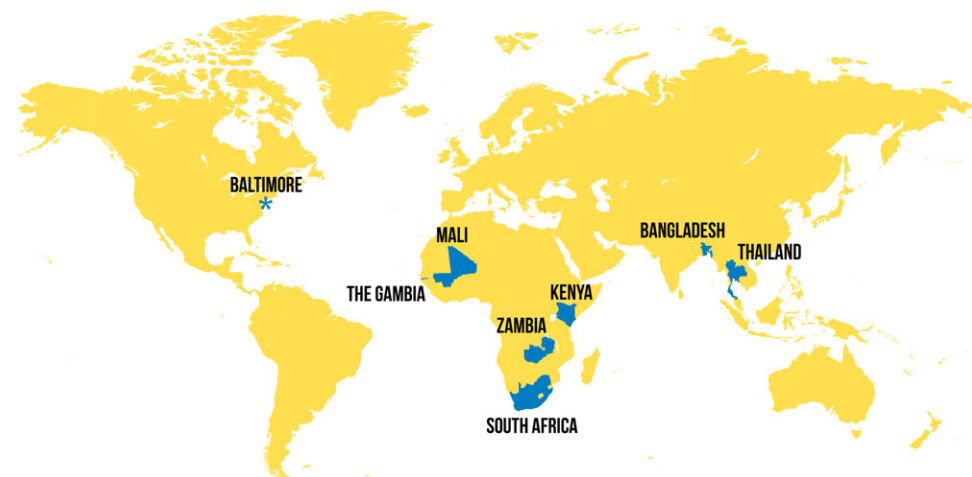
Figure 1. Map of study sites of the Pneumonia Etiology Research for Child Health project.

The sites where the PERCH study will recruit patients and controls includes 2 facilities: the Dhaka and Matlab hospitals of ICDDR,B (in the Dhaka and Chittagong divisions of Bangladesh, respectively); the former serves an urban population and the latter a rural population. The Dhaka hospital is a 350-bed facility supported by the Kamalapur urban field site, which has both active demographic and morbidity surveillance among a population of 350 000, of whom 11.5% are children <5 years old [17, 18]. Kamalapur has been involved in pneumonia studies since 1998 and has conducted pneumonia etiology surveillance since 2004 [19].